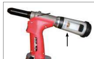
Knob for suction adjusting.