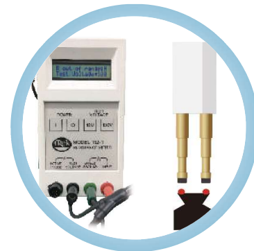
Total inspection by TREK surface resistance meter

※ In case of surface resistance, the resistance value may vary depending on the room temperature and humidity. We set the measurement point according to the pad size and shape, and conduct a total inspection,