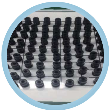
Put it on the measuring board in 100 units.

※ Actual measurement 10^7 \sim 10^8 : Acceptance 10^6 early half \sim 10^8 latter half : Rejection