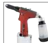
Flexriv on RIV504