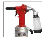
Flexriv on RIV505

Increases functionality, reduces encumbrance