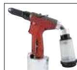
Flexriv on RIV503